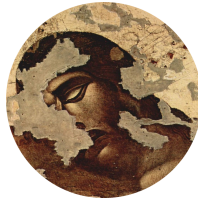
Painting in the Age of Cimabue