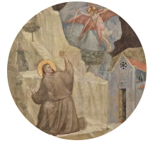
Painting in the Age of Giotto