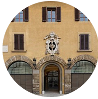
Museo dell'Opera del Duomo