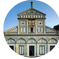
San Miniato al Monte