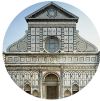
Santa Maria Novella