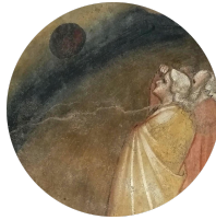
Post-Black Death Art in Florence and Tuscany