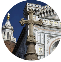
Foundations of Florence Historical Walk