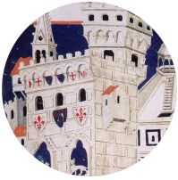
Rise of the Commune