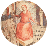
Politics and Pestilence in Trecento Florence