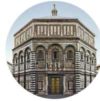
Battistero di San Giovanni