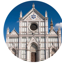
The Church of Santa Croce