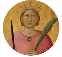
Saints and Relics of Florence