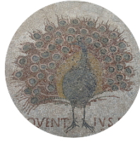
Early Christian Art in Florence